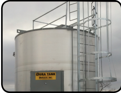
Standard Manway and ladder guard.