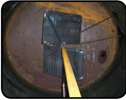
Special designed paddle agitation.