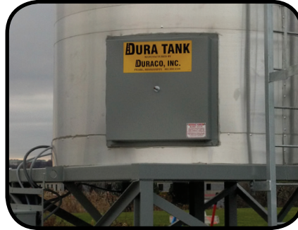
Convenient access panel.