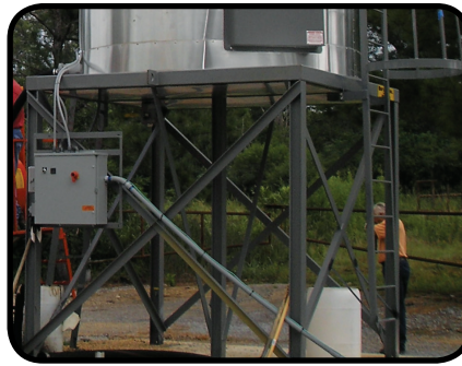
Optional 8 ft Leg System.