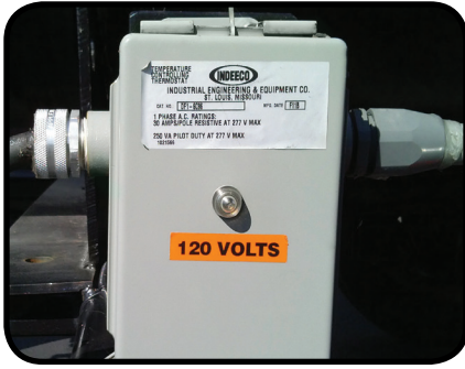
Overnight electric heat system.