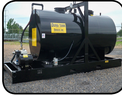
Skid mount available.