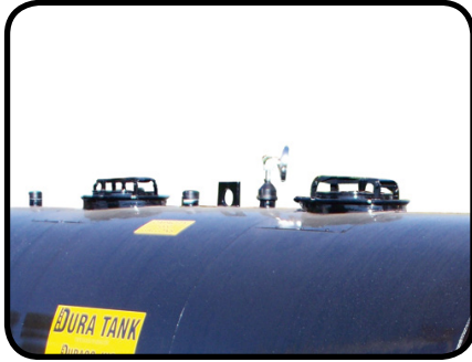
Easy - fill vented loading hatches.